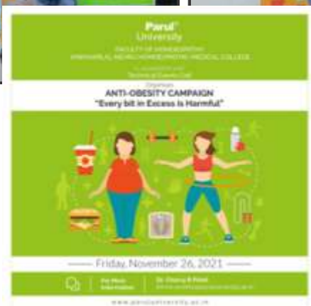
Glimpses of Anti Obesity Campaign conducted at JNHMC on 26.11.2021