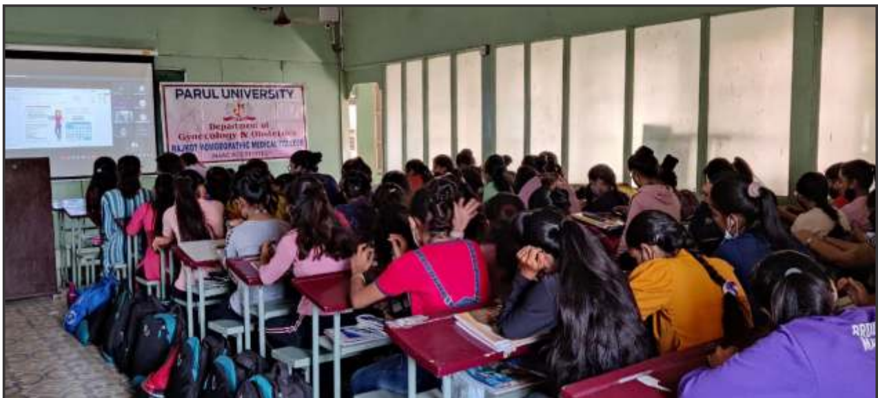
Awareness Program on Menstrual Health & Hygiene in association with Globalhunt Foundation was held on 22-11-2021 in RHMC