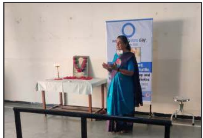
Awareness program: Anti-Diabetes week on account of World Diabetes Day from 14/11/21 to 21/11/2021 at JNHMCH